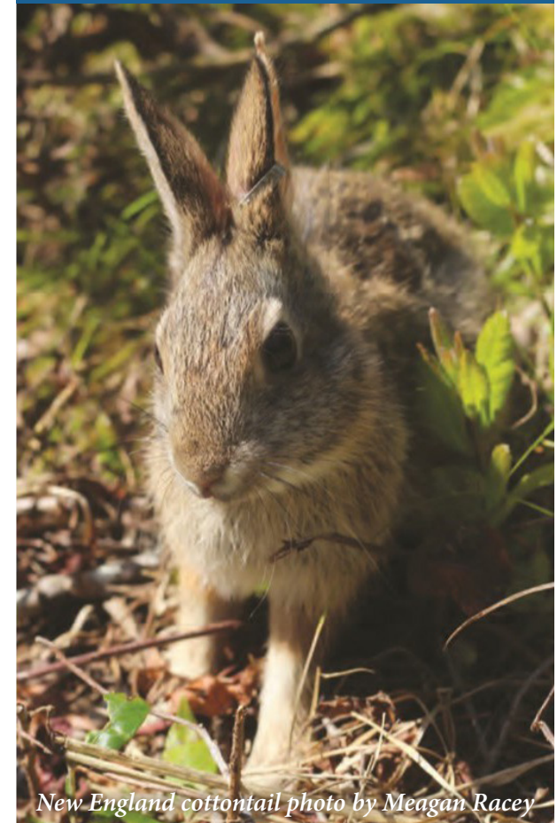
New England cottontail

Creating and Maintaining Habitat for the New England Cottontail