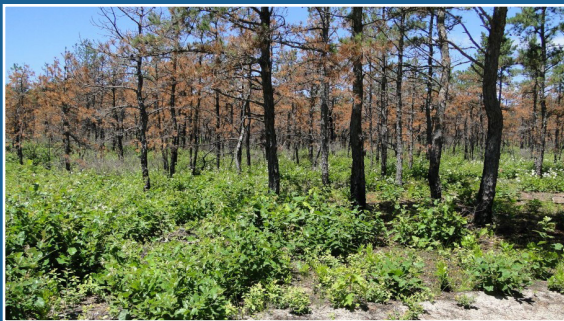
The dense understory of a pitch pine forest like the Mashpee Pine Barrens offers excellent cover for the NEC.

The NEC's diet consists of bark, twigs, leaves, nuts, berries, flowers, and grasses. Preferred sources of this food include raspberry, blackberry, highbush blueberry, willows, birch, and red maple.