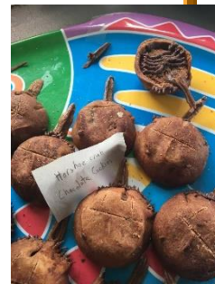
Delicious horseshoe crab cookies from the cookout!

areas, improving pollinator gardens, doing trail and chainsaw work at Coonamessett Reservation, and transplanting in the Falmouth Rod and Gun Club fields to name a few big events. All this and more was accomplished on a weekly basis by this dedicated group of AmeriCorps members. The Refuge and its partners are grateful for the amazing efforts of this crew.