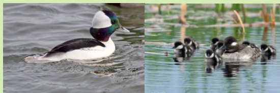
Male Bufflehead Duck